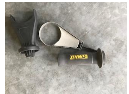
The foam piece is provided to allows the bolt to stay in place.