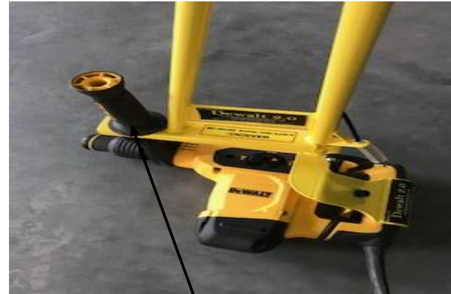
Dewalt Forward Handle

*Do NOT tighten the handle until the end of step 6!