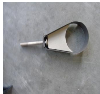
Provided Foam Piece