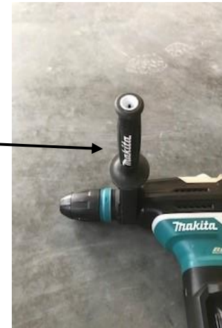
Makita/Bosch Forward Handle