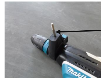
Foam allows for bolt to stay in place.

Attach BackSaver to the Makita/Bosch Drill. Make sure the correct model drill is inserted to the correct hole on the attachment.