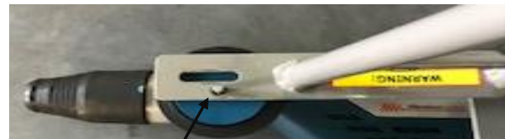
Bosch11264SDS and 11265S