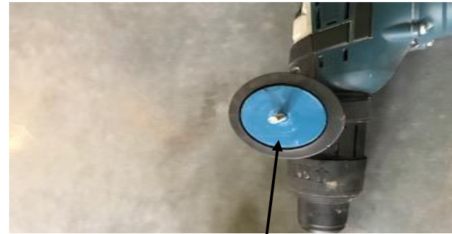
BackSaver Supplied Washer (For Bosch Models Only)

*Do NOT tighten the handle until the end of step 6