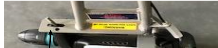
HR4041C, HR4013C, and HR4002