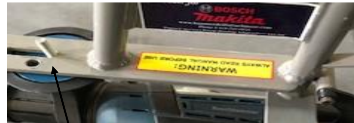
Bosch 540M and 540S